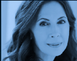
Lyubov Andreevna Ranevskaya Jessica HECHT