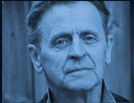
Firs Nikolaevich Mikhail BARYSHNIKOV

DURATION: 1 hour, 45 minutes with no intermission